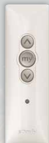
Wall mounted remote