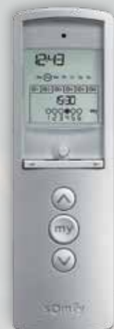
6 Channel remote with timer