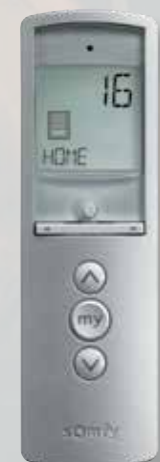
16 Channel remote

Revolutionary scroll wheel – specific for precise adjustment of venetian blind slats. Perfect for managing the level of heat and light entering a room.