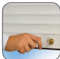
Spring Loaded With Key Lock (Up To 3.2m Wide)