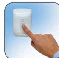
PowerSmart™ Control System With 12V Motor (Up To 50Kg) †*