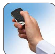
Remote Control (Key Ring Transmitter) With 240V Electric Motor & Multi-Function SIMU RSA Hz Radio Receiver & Control Unit