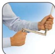
Crank Handle With Gear Ace (Up To 30Kg) See Page 42 For Universal Joint Position Options For Gear Ace Shutters