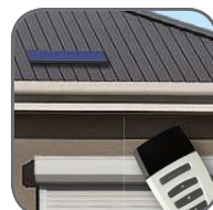
Remote Control With SolarSmart™ Plus Automation 12V Motor (Up To 50Kg)