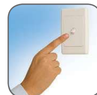
Wall Switch With 240V Electric Motor*

† When used in conjunction with an assist spring as per CW Products specifications. * Control options must be installed in an indoor environment.