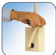
Steel Cable Winder (Up To 50Kg)*