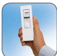
Remote Control With 240V Electric SIMU Hz Motor