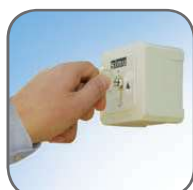
Key Switch With 240V Electric Motor