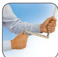
Crank Handle With 240V Electric Manual Override Motor