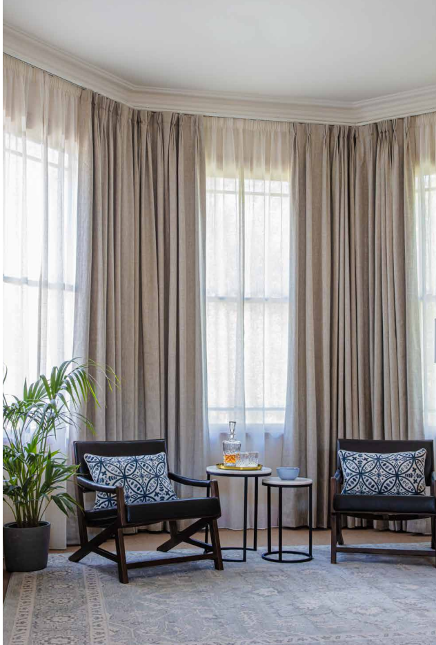
Sheer curtains paired with blockout lined curtains