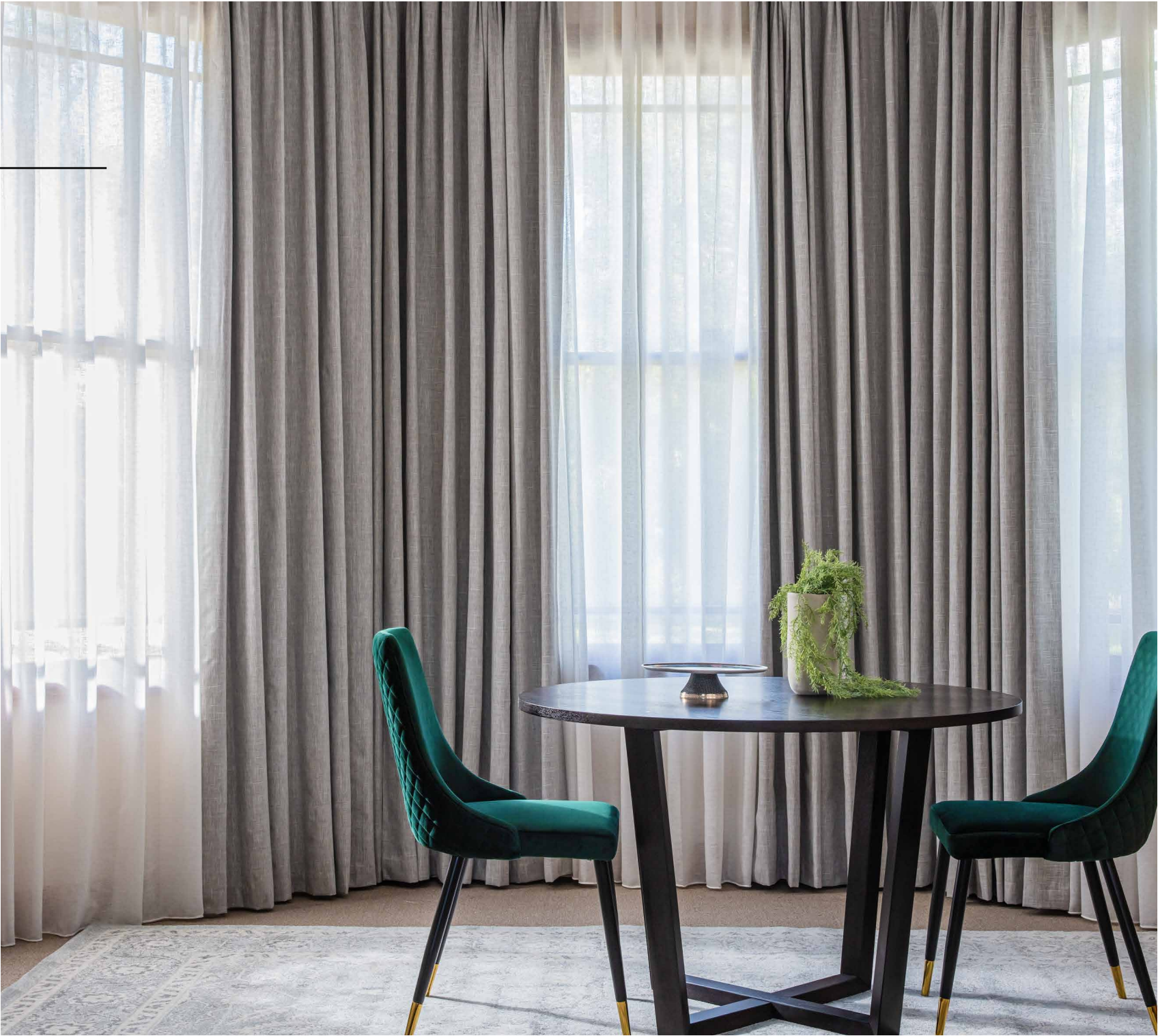
Sheer pencil pleat curtains paired with triple pinch pleat curtains and blockout lining

Maintaining privacy day and night is an important consideration for many homeowners, particularly for bedrooms. There are endless mix-and-match window covering options to achieve the perfect balance of view-through as well as day and night time privacy.