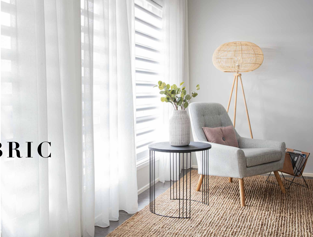
Sheer curtains paired with Pirouette® Shadings