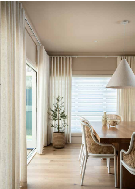
Coated curtains paired with Pirouette® Shadings

The Luxaflex curtain collection delivers both style and substance, with an array of fabrics from plain to patterned and elegant linen looks and blends. Select from sheer, uncoated, coated and lined fabrics to achieve the perfect combination of privacy, light control, insulation and designer appeal.