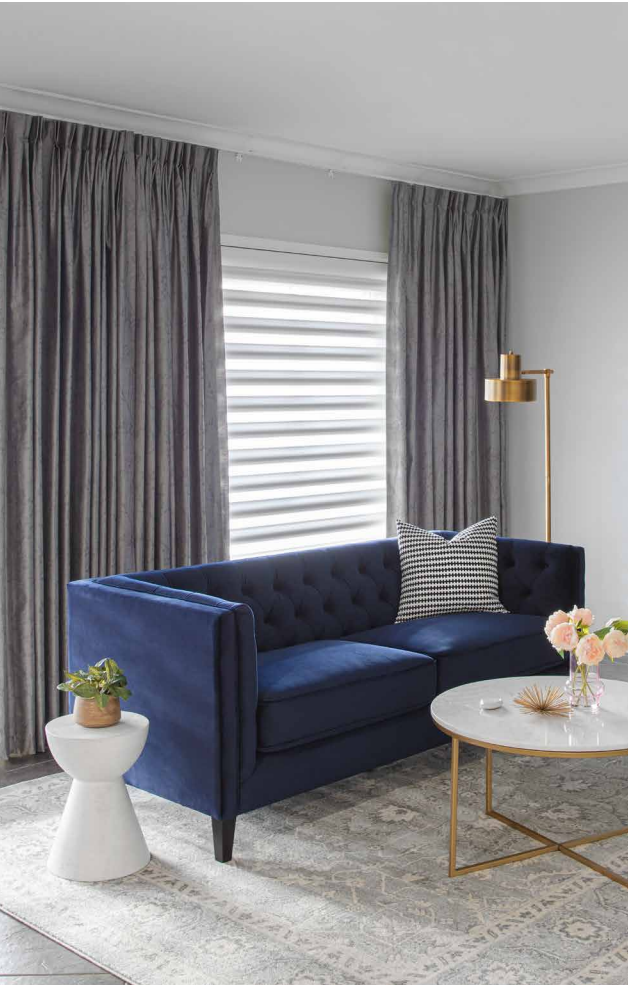
Lined blackout curtains paired with Pirouette® Shadings

The Luxaflex curtain collection delivers both style and substance, with an array of fabrics from plain to patterned and elegant linen looks and blends. Select from sheer, uncoated, coated and lined fabrics to achieve the perfect combination of privacy, light control, insulation and designer appeal.