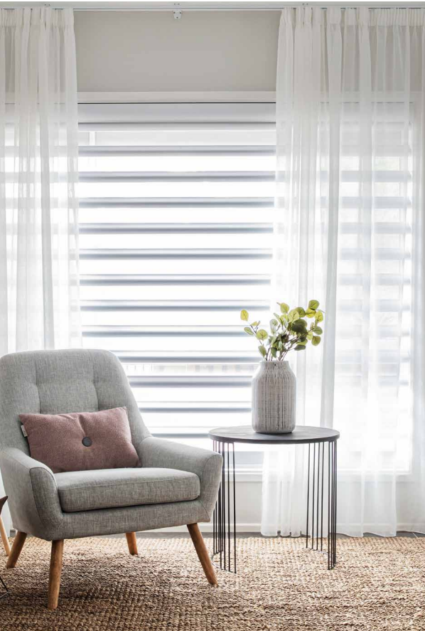
Sheer pencil pleat curtains paired with Pirouette® Shadings

For over 65 years, Luxaflex Window Coverings have transformed Australian homes with leading designs and inspiring fabrics. This tradition continues today with the Luxaflex curtain fabric collection.