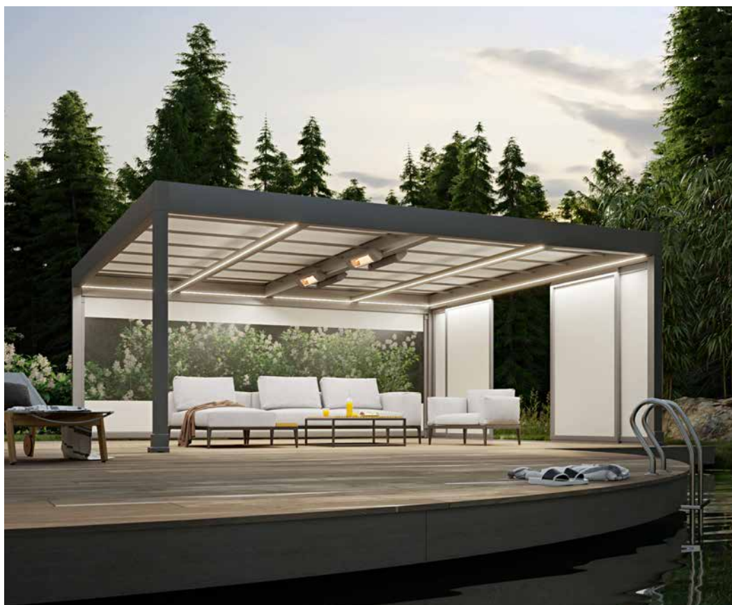
Your very own personal space in the open air