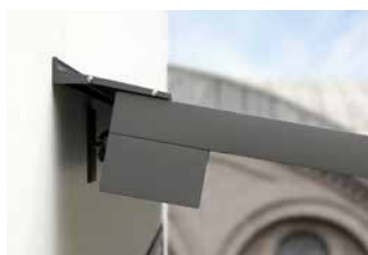
An “all-round” achievement

Highlighted with LED Spots attached to the cassette or LED Line in the cassette, on the guide tracks and / or in the light bar guarantee endless hours of pleasure outdoors – even long after the sun has set.