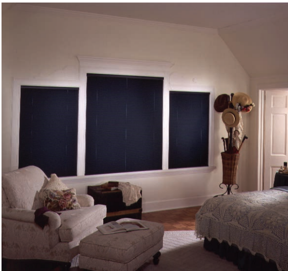
The Twi-Nighter System eliminates light leakage for a complete blackout solution.

Luxaflex Aluminium Venetian Blinds are available with a slimline 25mm slat in a range of traditional and modern colours. Slats are seamlessly colour coordinated with the hardware system for a premium interior aesthetic.