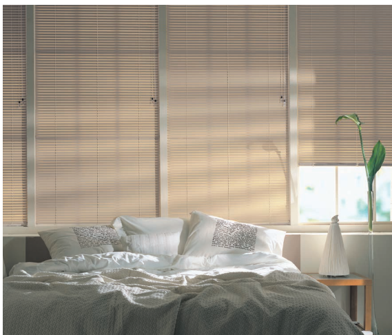
Cord and Wand operation.

Combines modern design with maximum lighting and privacy control. Available with the 25mm Standard Venetian Blinds, the Duo-Flex operation allows you to control the top and bottom section of the blind separately for ultimate flexibility and control comfort. Tilt the top section open to filter light into the room and close the bottom slats for privacy.