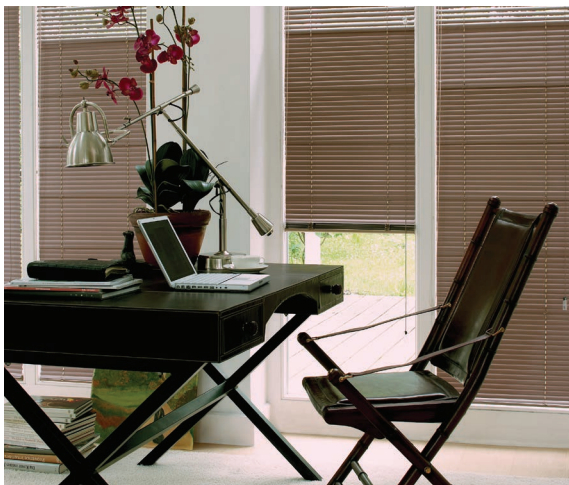
Duo-Flex operation for flexible light and privacy control.