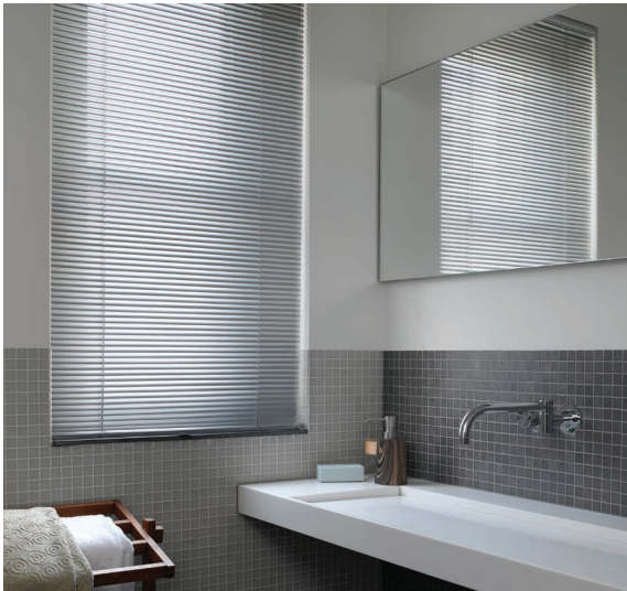
Available in a range of colours and finishes in a 25mm slat width.