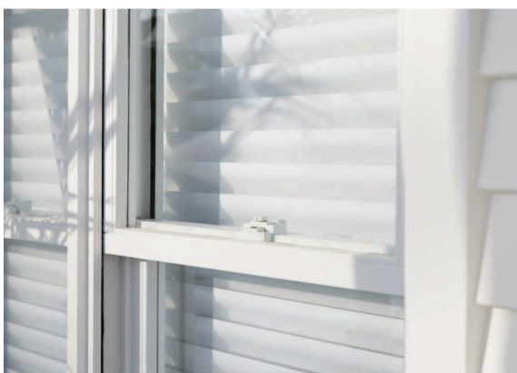
White sheer fabric backing reflects sunlight

The sheers softly filter light protecting flooring and furnishings from harsh UV rays. Simply tilt the vanes to achieve your desired level of light. Open the vanes for light diffusion and daytime privacy whilst maintaining a view through your window. Adjust the vanes for greater light deflection and privacy. Close the vanes for complete privacy and UV protection.