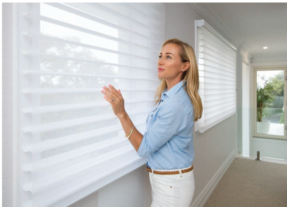
Well engineered for a clear view through

Our focus on quality, innovation and design excellence stems from our original Silhouette Shadings invention. Cleverly engineered, Luxaflex Silhouette Shadings feature soft S-shaped vanes between two sheer fabric panels for an elegant appearance of floating vanes. The unique S-shaped fabric vanes bounce incoming light up onto the ceiling and naturally brightens the room. Choose from three vane size options 50mm, 65mm and 75mm.