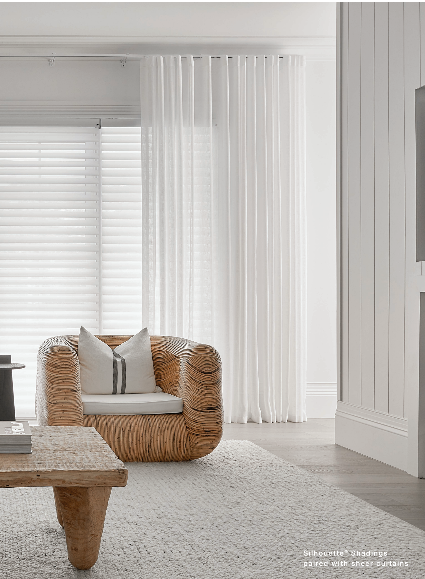
Silhouette® Shadings paired with sheer curtains