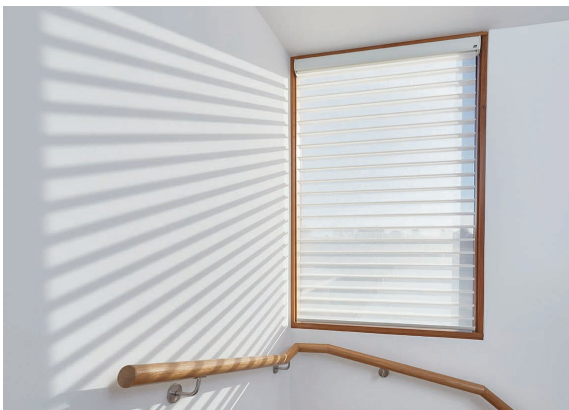
Softly filters sunlight

We designed the weave on the front and rear sheer facings to avoid moiré effect at the window. Moiré is a visual strobing effect that occurs when an open fabric weave is placed in front of another similar weave, obstructing the view through and potentially causing headaches or migraines. Many imitation products are known to do this. Don't settle for anything less than the original and the best.