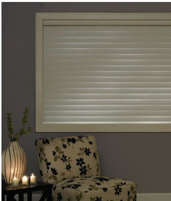
Room Darkening Vane

Made from 100% anti-static polyester, Silhouette Shadings naturally repels dust and dirt off the shade for easy maintenance with only an occasional light vacuum required.