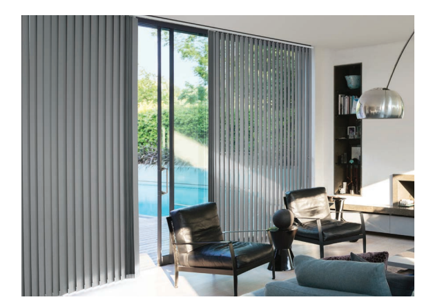
An ideal solution for large sliding doors.

Luxaflex Vertical Blinds feature vertical fabric vanes that can be easily rotated to control the level of privacy and direction of the light entering the room. With 200 degree vane closure, minimum light leakage between fabric vanes provides enhanced room darkening and privacy.