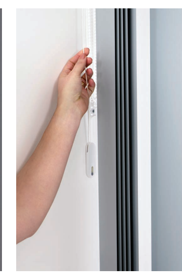
Chain & Cord Operation