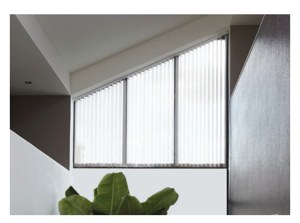
Solution for large sloping and irregular shaped windows.