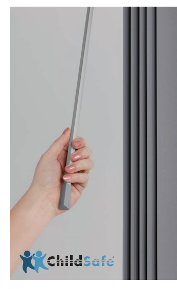
Traversing Wand Operation

Earless bottom weights for enhanced child safety.