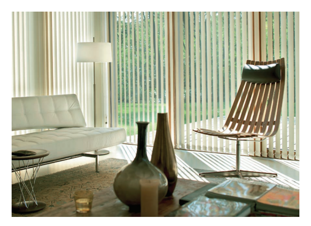
Angle vertical fabric vanes for light control.